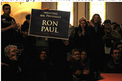
Crowd cheering: "Ron Paul! Ron Paul! Ron Paul!"